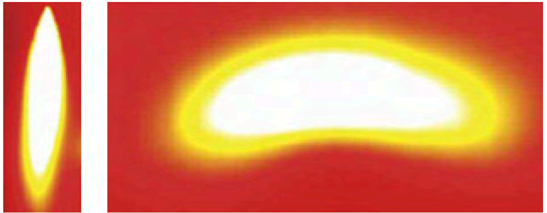
OPTIFIRE JL burner top (left) and front (right) views. Note: Images not to scale.

The OPTIFIRE JL burner has the following geometrical characteristics: