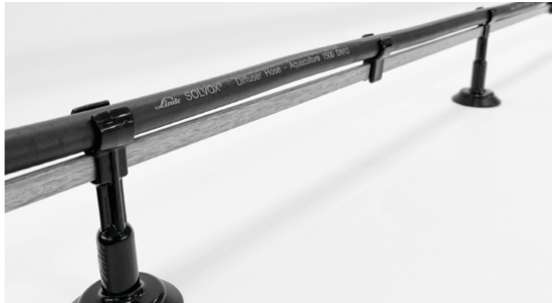
SOLVOX® aquaculture diffuser hoses

Challenge Emergency oxygenation has been a standard safety feature in most fish farming tanks for decades. It is typically implemented by stretching diffuser hoses horizontally across the base of the fish tank. Attachment systems for diffuser hoses are often custom made and limited to one specific type of substrate. Custom made solutions do not always meet the standards that should apply for proper function and fish welfare. In addition, random diffuser designs have been known to compromise self-cleaning hydraulics in the tank. As a result, existing solutions often involve a lot of maintenance effort and are costly to repair or replace.